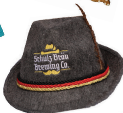
Bavarian Hat, Earrings, and 2L Glass "Das Boot"