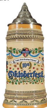
Ceramic Stein with Lid